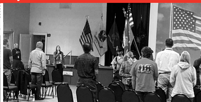
Thank you to the Lynn English High School ROTC for performing at the GE Veterans Day commemoration and thank you to all who attended.