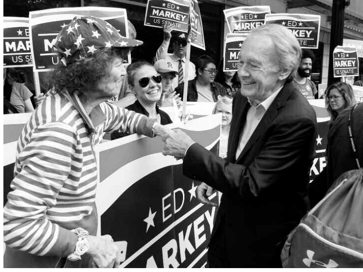
Senator Markey at the GBLC Labor Day Breakfast