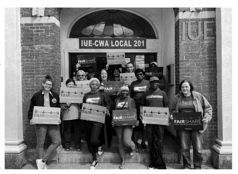
Door Knocking Volunteers on April 30, 2022

Another thing to look out for on the November ballot is MA Bill HD2582, the Gig Worker dilemma - should they, and do they want to be classified as independent contractors or employees? The classification of these workers is important, and this political battle in Massachusetts is something to pay attention to, as it could potentially completely reinvent our state's economy and how corporations can classify their workers. Prop 22 passed in California, and gig workers like Lyft and Uber drivers, and other Gig workers, will remain classified as independent contractors with some upgraded benefits, but they will never have things like guaranteed