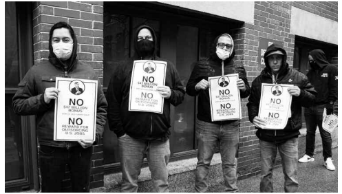
GE Shareowners Meeting Protest: No Reward for Outsourcing