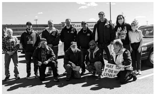
May 1st International Workers Day, Labor and Community Unite for GE Jobs and Justice