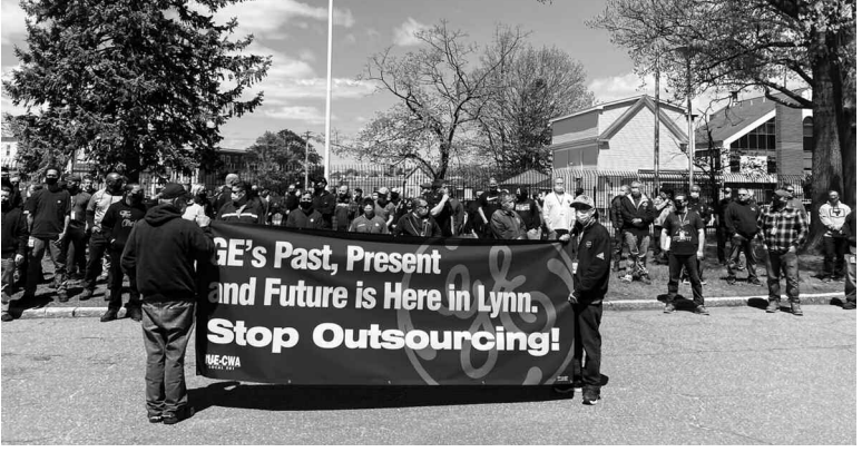
1st Shift 201 members gathered at Lunch to show our unified commitment to the successful future of the GE Riverworks plant.